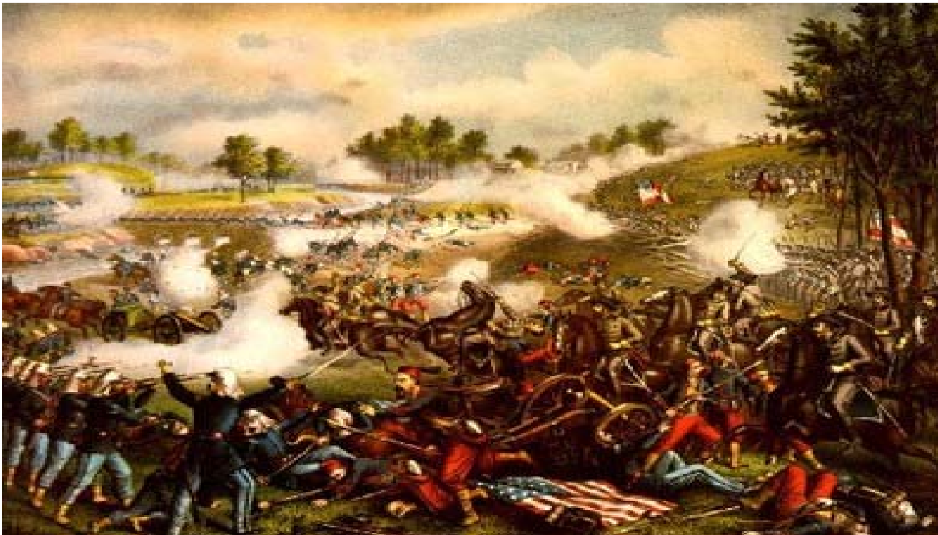
First Battle of Manassas

http://www.usa.gov/Topics/Memorial_Day.shtml